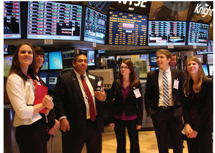
Students tour the trading floor of the New York Stock Exchange.

The accounting major specializes in financial and managerial accounting, which prepares students